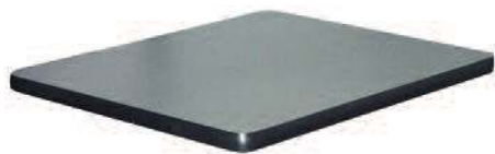
Laminate top included with model no. LPSR-1226GT