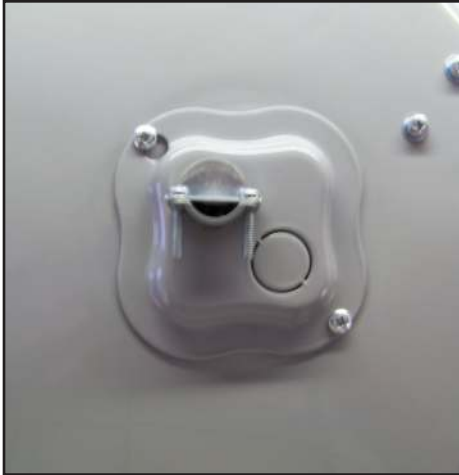
Rear removable entry plate with included 1/2" Romex connector.