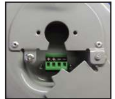
1/2" fitting hole shown after squeeze connector has been removed.

NOTE: The squeeze connector provides strain-relief for cables feeding into the speaker and out to the next speaker in a string.