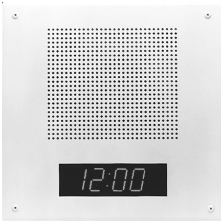
Sample installation. Clock is not included with grille.