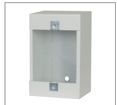
One-gang surface-mount wall box (P1X), order separately.

The switch shall include a one-gang, surface-mount, USA-certified, 20-gauge steel wall box with white powder-coat finish, Lowell P1X. The box shall measure 4.625"H x 2.875"W x 2.5"D. It shall feature 0.5" side and rear knockouts.