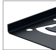
Flange on two sides for added strength