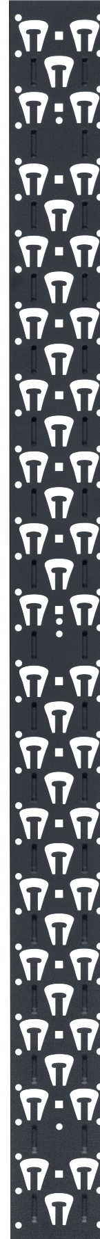
Model CMV5-35 shown

1 rack unit (RU or U) = 1.75 inches or 44.45 mm. Some measurements have been rounded.