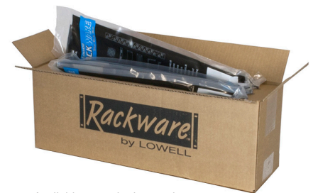
Available as a single panel or in multi-pack cartons.

The rack shall include ____ (quantity) vent panels, Lowell model _____, which shall be 18-gauge steel with smooth-black powder-coat finish and 35% open area. Each panel shall measure 19"W x ____ rack units and feature a ____ 0.625" flange. Panels shall be made in the USA with USA-certified steel. They shall also be EIA/TIA compliant, Trade Agreements Act (TAA) compliant, and Buy American Act (BAA) compliant.