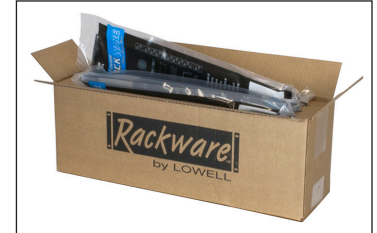
Available as a single panel or in multi-pack cartons.