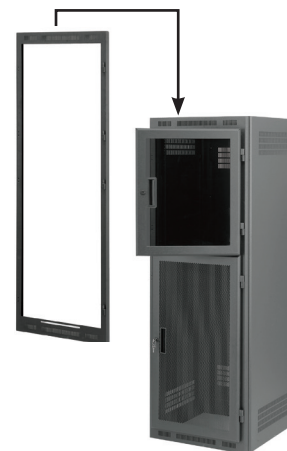
The dual-door frame accepts 1 or 2 short doors, allowing access to some equipment while securing other electronics.

*Order LFD Series door(s) separately according to size indicated in chart. If two doors are used you may want to order an alternate key lock assembly (LLKRD) for one door for separate access.