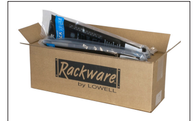
Available as a single panel or in multi-pack cartons.