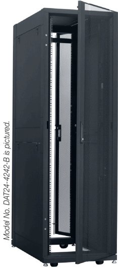
Model No. DAT24-4248-B is pictured.