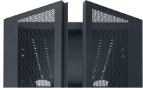
High-flow vented rear door split for easy access