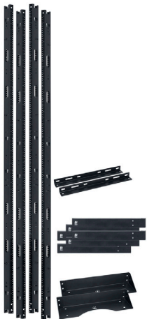
NR4PA Series racks ship unassembled.