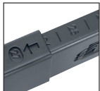
Side supports have a window that shows depth setting.