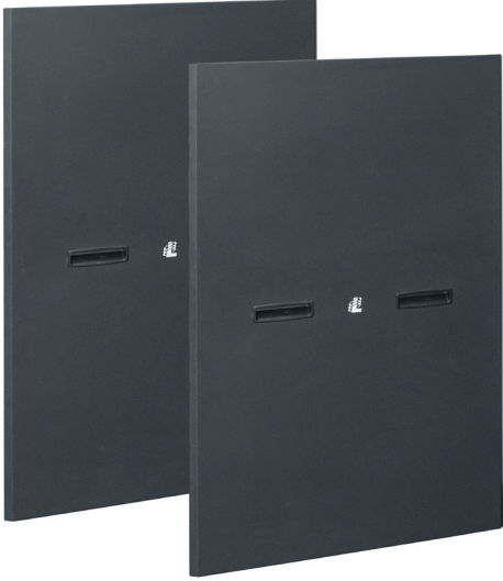
Side panels consist of two pieces per side.