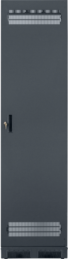
Recessed rear door with cable entry brush panel.