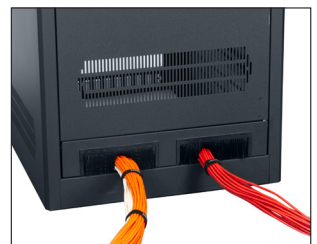
Open bottom brush panel allows large cable bundles to be installed in rear of rack, without fishing.