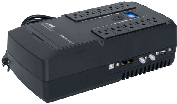
Chassis (6.2 x 12 x 3.7 in.) weighs 6.4 lbs.