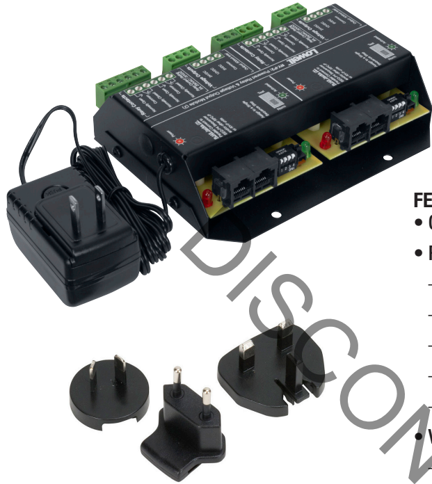
Relays include an attached power supply with NEMA 1-15 plug, plus three adaptors for use in areas outside North America.