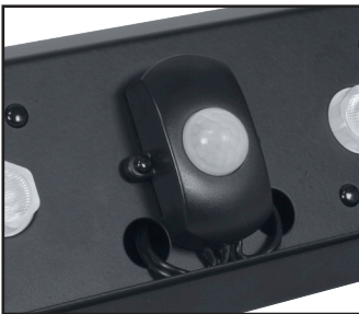
Auto on/off proximity switch