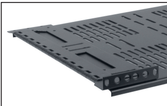
Hinged shelf ships flat