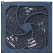
Optional: Fan filter, model FW-FF.

The thermal management panel for E.I.A. rackmount installation shall be Lowell Model No. FW2-3T, which shall be 16 gauge U.S. steel finished in black powder epoxy paint. It shall measure 3U x 19"W and include 2 whisper fans with guards. Each fan shall have a 4.7" diameter with 50 cfm airflow and 28 dBA noise rating. The panel shall feature a 6-ft. green thermo cord which shall have an integral thermostat to automatically control fan activation, turning them on when ambient temperature reaches 86°F [30°C] and off when temperature reaches 72°F [22°C].