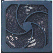
Optional: Fan filter, model FW-FF.

The thermal management panel for E.I.A. rackmount installation shall be Lowell Model No. FW4-7, which shall be 16 gauge U.S. steel finished in black powder epoxy paint. It shall measure 7U x 19"W and include 4 whisper fans with guards. Each fan shall have a 4.7" diameter with 50 cfm airflow and 28 dBA noise rating. The panel shall include a 6-ft. cord with plug.