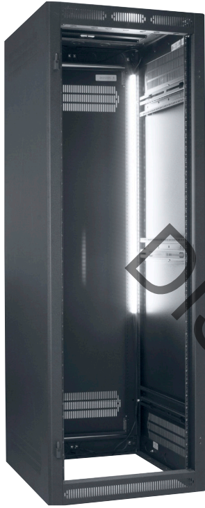
Model RLB-KIT-40P mounted in LER Series rack.