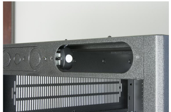
Hidden location behind knockout panel.