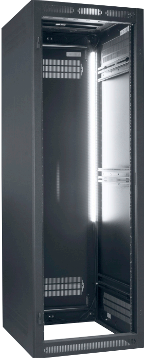
Model RLB-KIT-40 mounted in LER Series rack.