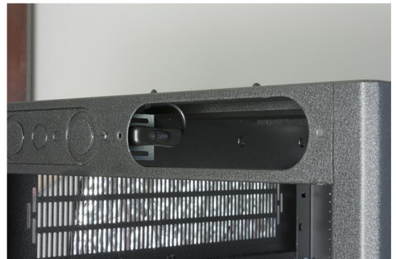
Hidden location behind knockout panel.