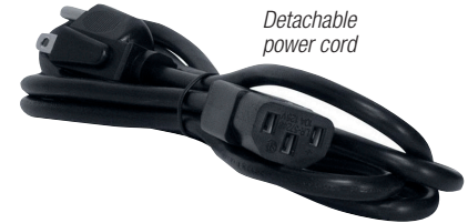
Detachable power cord