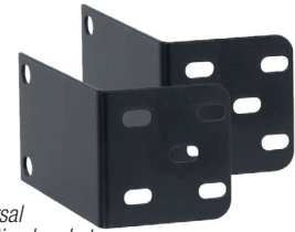
Universal mounting brackets