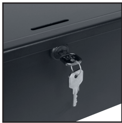
Keyed lock and integral front handle.