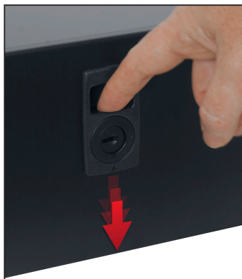
Door opens from the top.

The steel storage box for 19"W rackmount use shall be Lowell Model #SBL-39, which shall be fully welded 16-gauge steel with smooth black powder epoxy finish. It shall measure 9.00"D x 19.00"W x 5.22"H and use panel space of 3 rack units. It shall have a front door with bottom hinge so it opens from the top. It shall feature a keyed lock and slam latch closure. Load rating shall be 50 lbs.