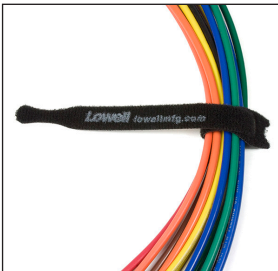
Optional velcro cable wraps (#VCW-12) help organize cables.