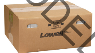
Available in multi-pack contractor cartons.