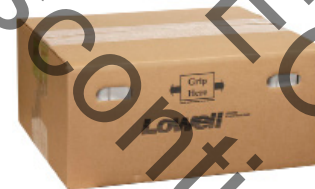
Available in multi-pack contractor cartons.