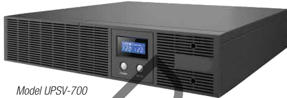
Model UPSV-700 includes 2 brackets and tower pedestals.