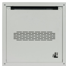
Optional cover panel