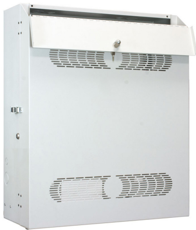
Flip-top allows access to upper bay without opening main compartment.