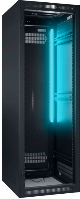
Model RLB-KITB-40 (simulated effect) mounted in LER Series rack.