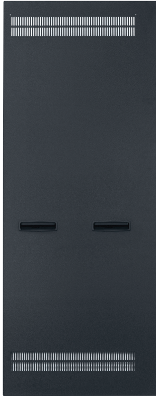
Models #SDV-3026, #SDV-3826 and #SDV-4426 feature two handles.