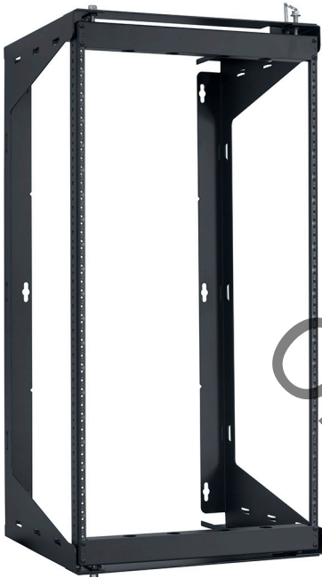
Model #SR-2018 pictured.