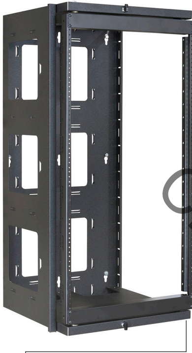
Gate swings open from a fully open side, which gives you extraordinary access to equipment and cables.