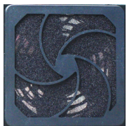
Optional: Fan filter, model FW-ff.