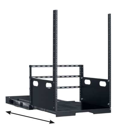
Rack lides forward for access to the rear of equipment and connections.