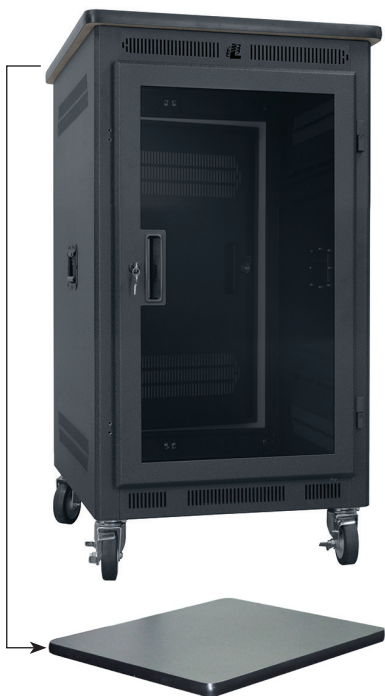
The LPR--PGT Series rack includes a 1"H premium Graphite Grey laminate top with rubber edge molding, which attaches to (and hangs over) the rack's standard steel top.