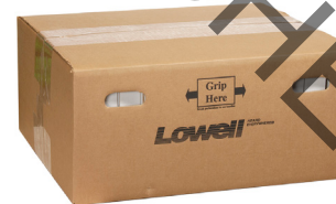
Available in multi-pack contractor cartons.