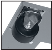
The base features 3" swivel casters