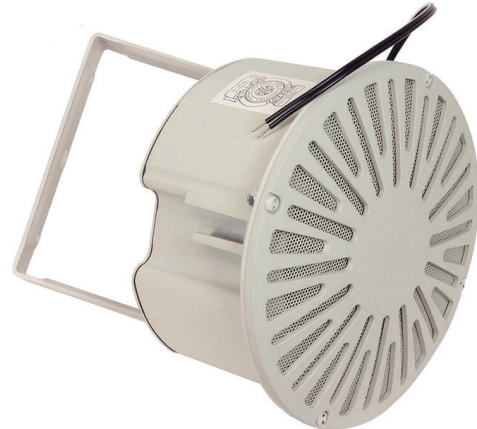
SURFACE-MOUNT: Model LUH-VRG grille mounted to the Unihorn in a surface-mount application using U-bracket Model LUH-BRKT (horn's trim ring is not used).