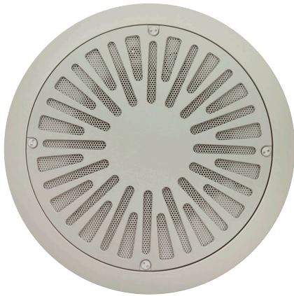
RECESSED: Model LUH-VRG grille mounted to the Unihorn in a recessed application, with the horn's trim ring in place.