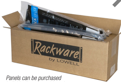
Panels can be purchased individually or in multi-pack cartons.