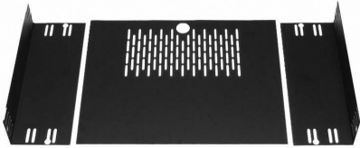
Three piece shelf can be installed to emulate 2U or 3U panel space.