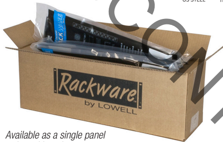
Available as a single panel or in multi-pack cartons.