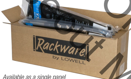
Available as a single panel or in multi-pack cartons.