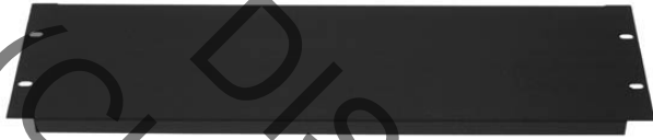
0.5" flange for strength