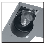
The base features 3" swivel casters