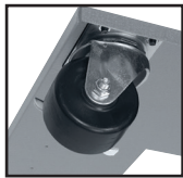
The base features 3" swivel casters