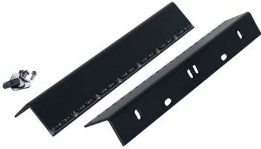
RRD series rails are tapped to accept threaded 10-32 screws (RRD-7 shown).