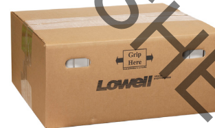
Available in multi-pack contractor cartons.